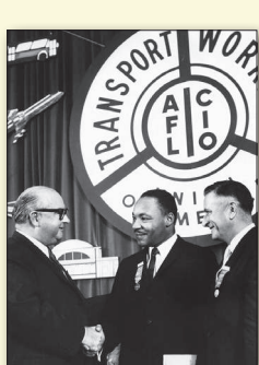
Mike Quill greets Dr. King before the civil rights leader addressed the TWU convention in 1961.