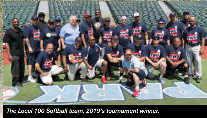
The Local 100 Softball team, 2019's tournament winner.