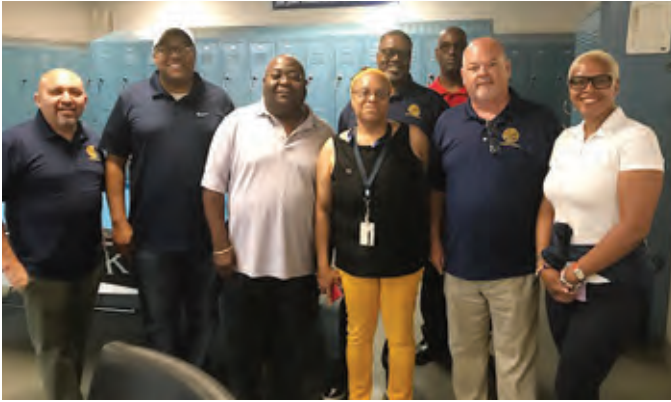
International TUUS Staff with Local 171 members in Ann Arbor