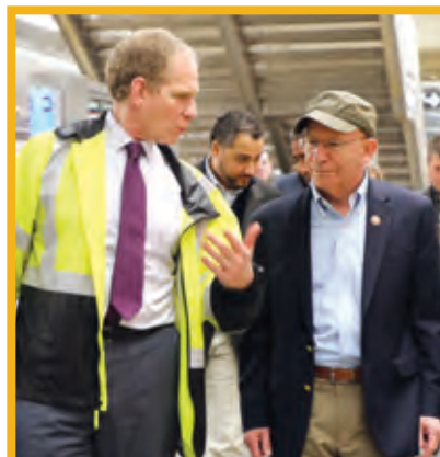
Rep. DeFazio takes a tour of the New York City subway

Prior to coming to Congress, I served as a county commissioner and saw firsthand the importance of a strong transportation network for economic development and jobs. That's why I first joined the Transportation and Infrastructure Committee and why I'm fighting for a reinvigorated Federal role and a 21 st -century vision to meet the transportation needs of future generations. It's not enough to merely maintain what we have; we must also modernize our transportation systems to combat