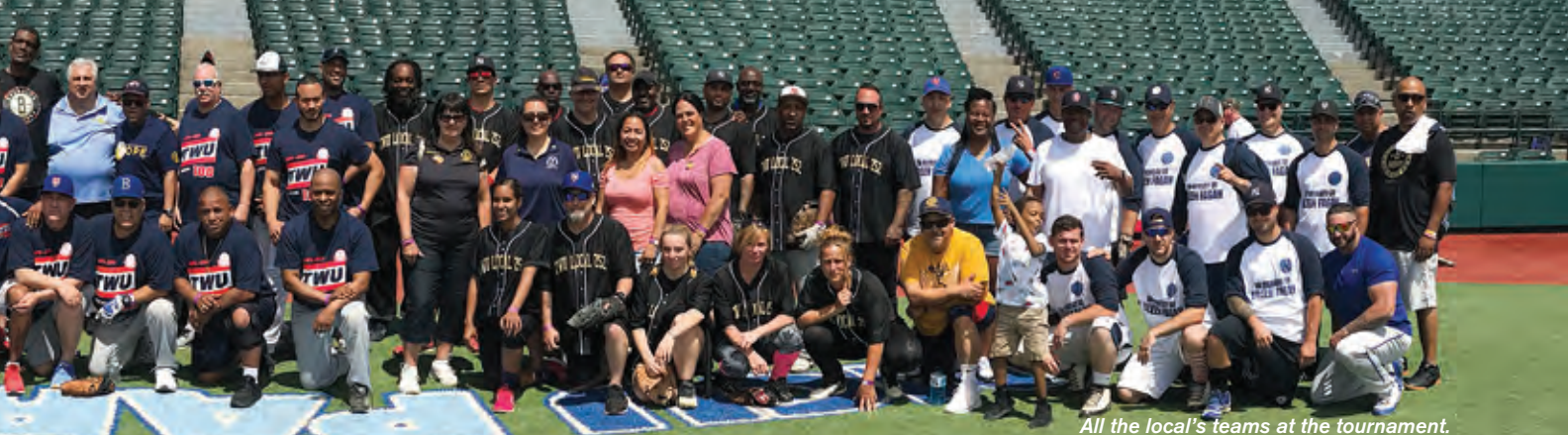
All the local's teams at the tournament.