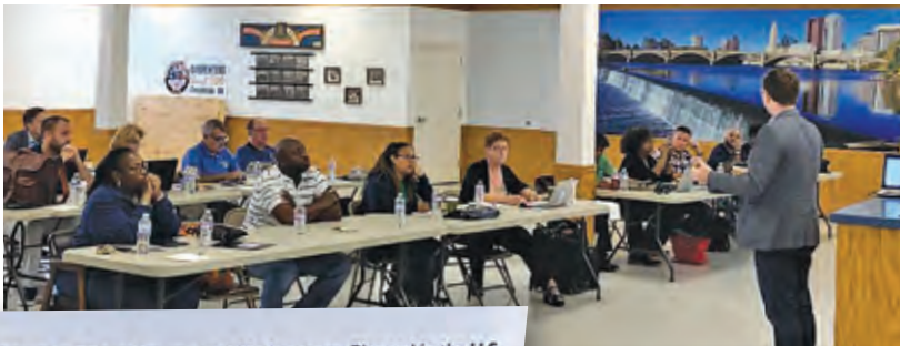
AV Shuttle Pilots Completed, Underway or Planned in the U.S.