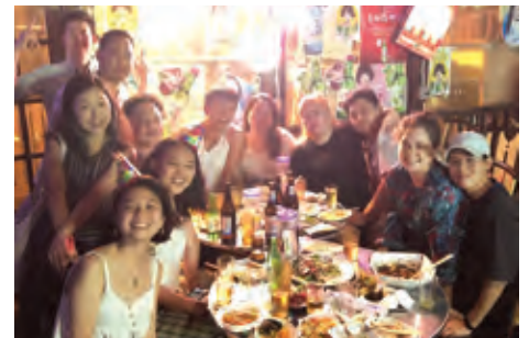
MinKwon workers celebrate their organizing win.

Bargaining for the inaugural contract will begin this fall.