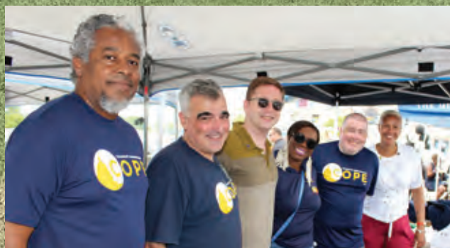
TWU International Staff worked the COPE booth.

15 for the annual Family Day. Check out the photos!