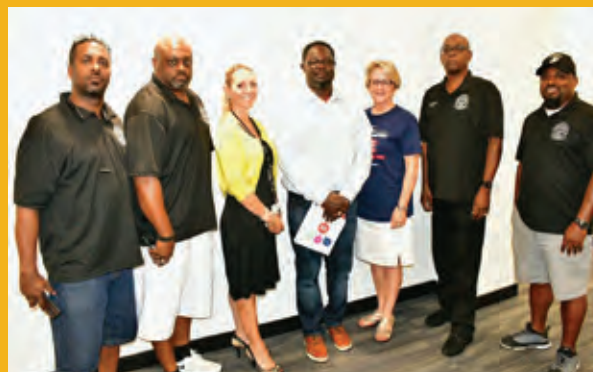
Local 208 members

A COTA bus is wrapped with an advertisement expressing veteran/military employee appreciation.