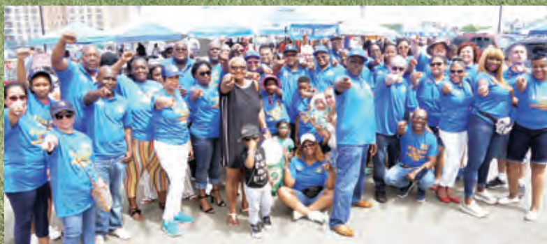
Station Division members