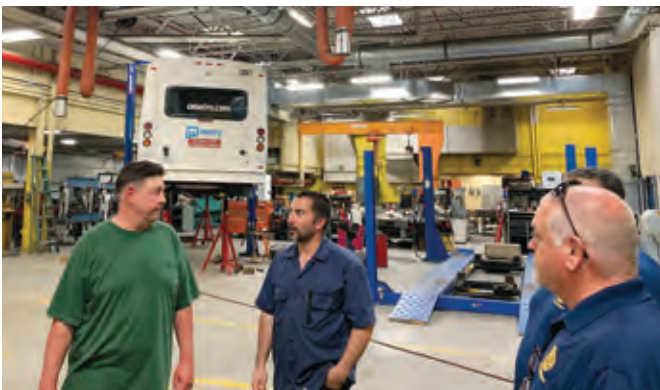
On the shop floor at Local 223