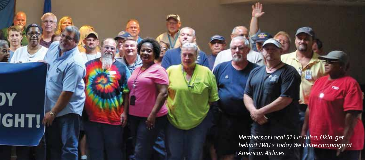
Members of Local 514 in Tulsa, Okla. get behind TWU's Today We Unite campaign at American Airlines.

last few months. I've seen members who spent years in the shadows come front and center, not just wearing a button, but talking to their brothers and sisters, engaging them, pulling together to restore their dignity and fight for their families."