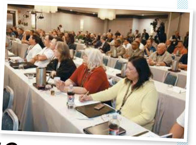
Delegates to the 2010 COPE . Legislative Conference

Nearly 200 TWU Local activists from around the country attended the 2010 COPE Legislative Conference in Washington, DC in late April.