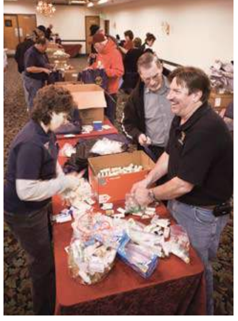
TWU volunteers sort items to be distributed to the wounded warriors at Walter Reed.

"The ATDVC is a great group and I am really happy that they were able to coordi-