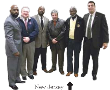
New Jersey State Conference