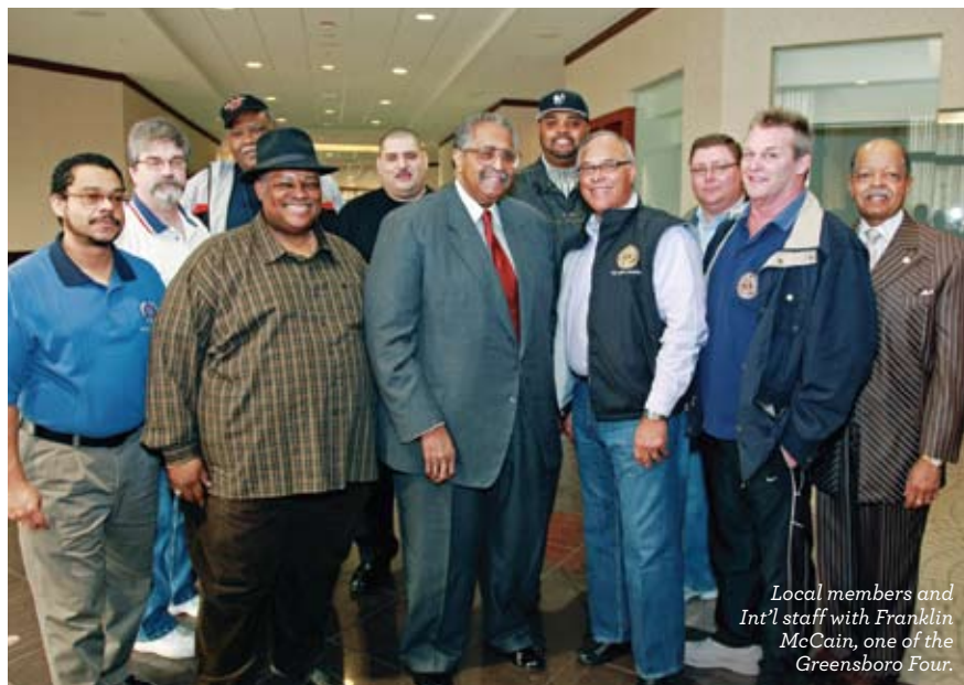
Local members and Int'l staff with Franklin McCain, one of the Greensboro Four.