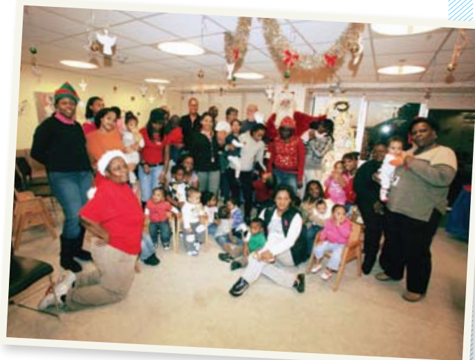
↑ Local 100 members delivered toys to children.

TWU members and officers across the country made the holidays a little happier for those in need. When times are tough, as they were for many Americans this holiday season, a little extra giving can go a long way. TWU's giving stretched from California to New York as Locals donated toys and money and made wishes come true this holiday season.